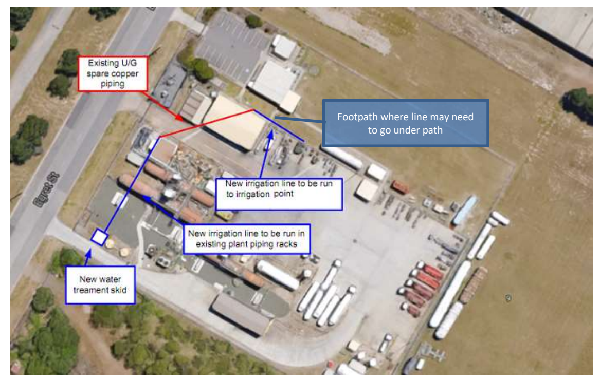
Figure 5-1: Proposed irrigation pipework system diagram

A new segment of the irrigation line is to be installed. The pipeline will be run above-ground to the irrigation point aboveground as shown in Figure 5-1. Where required, such as where there is an existing footpath, it will be run underground for the short distance using directional drilling.