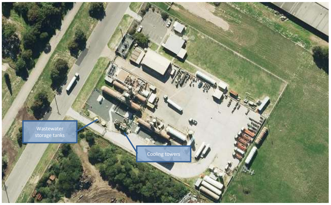
Figure 3-2: Location of BOC Kooragang's cooling towers and wastewater tanks

Current site plans are provided in Appendix E.