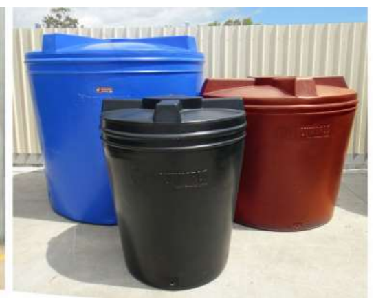
Figure 5-2: Proposed example of filter housing

Figure 5-2 shows the proposed filter housing from supplier Polyworld. The filter housing is two (2) polyethylene 1,000 litre tanks.