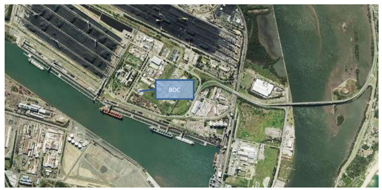
Figure 6-1: Hunter River and BOC Kooragang location

The effluent quality has been shown to be of a low to medium quality with minimal metal concentrations and no detected pesticides or herbicides. Therefore it is not expected that the effluent will have a negative effect on the Hunter River.