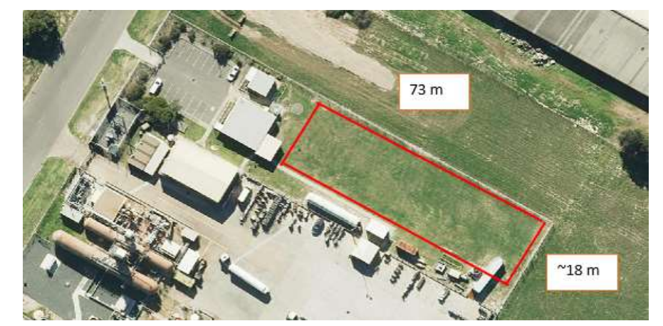
Figure 7-1: Proposed irrigation area

Table 7-2 shows the calculations performed for the water balance at BOC Kooragang. The water balance calculations use the following data as input: