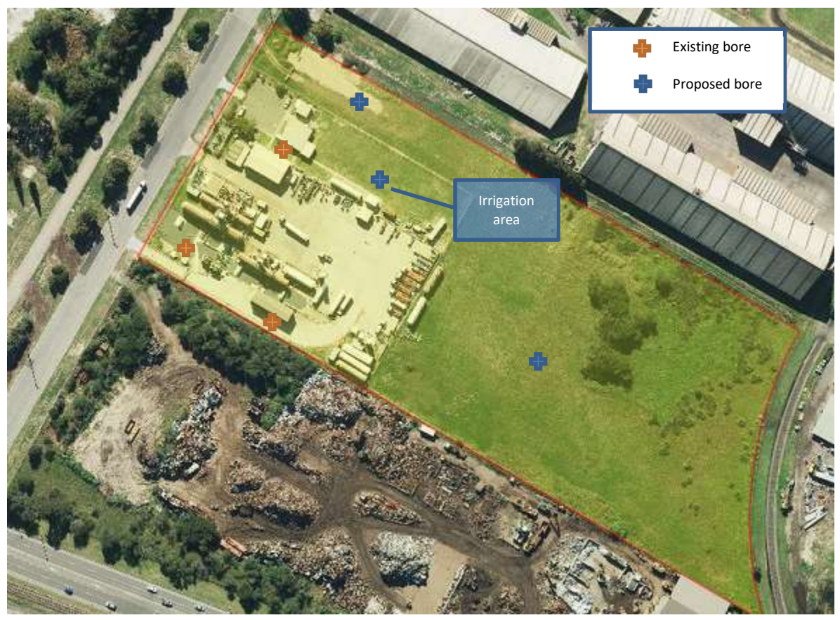
Figure 8-1: Existing and proposed location of BOC Kooragang's groundwater bores (marked with crosses)