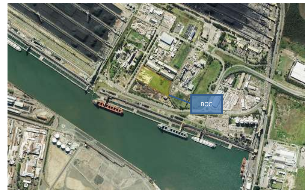
Figure 3-1: BOC Kooragang site boundary and vicinity (Spatial Information Exchange [SIXMaps] 2017)

The facility supplies and manufactures compressed and bulk gases for industry. BOC Kooragang processes waste carbon dioxide gas to liquefied form, and manufactures liquefied nitrogen gas as a by-product. The facility operates 24 hours a day, 7 days a week. The waste carbon dioxide is provided from Orica's Kooragang facility through a pipeline, liquefied, and stored in aboveground tanks prior to processing. The by-product nitrogen gas is stored, and sold as a product redistributed from BOC Kooragang via a direct pipeline to the nearby Cargill facility.